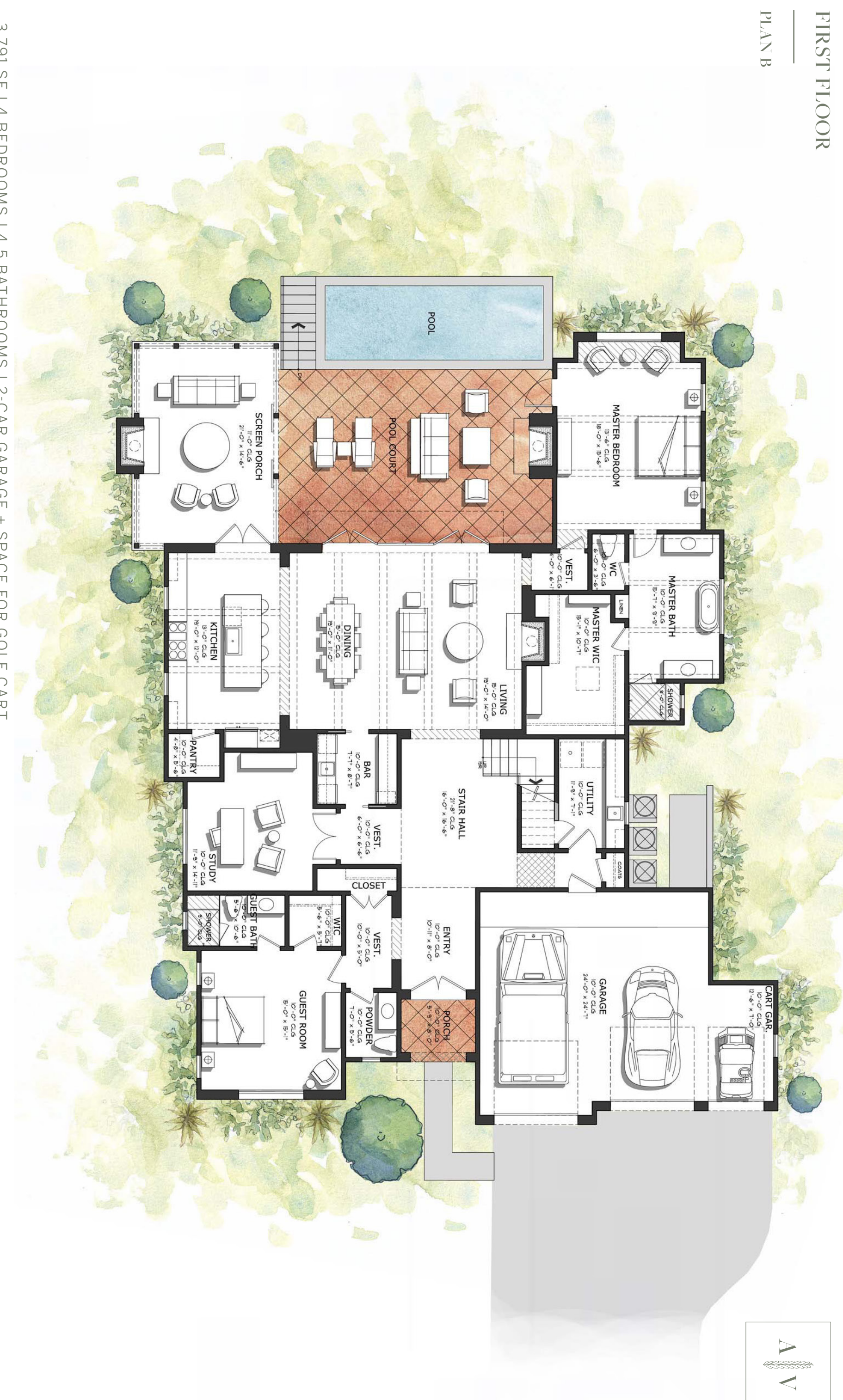
3,791 SF | 4 BEDROOMS | 4.5 BATHROOMS | 2-CAR GARAGE + SPACE FOR GOLF CART *VILLAS WITH THE DEN ALLOW FOR AN ADDITIONAL 350± SF OF CONDITIONED LIVING SPACE*