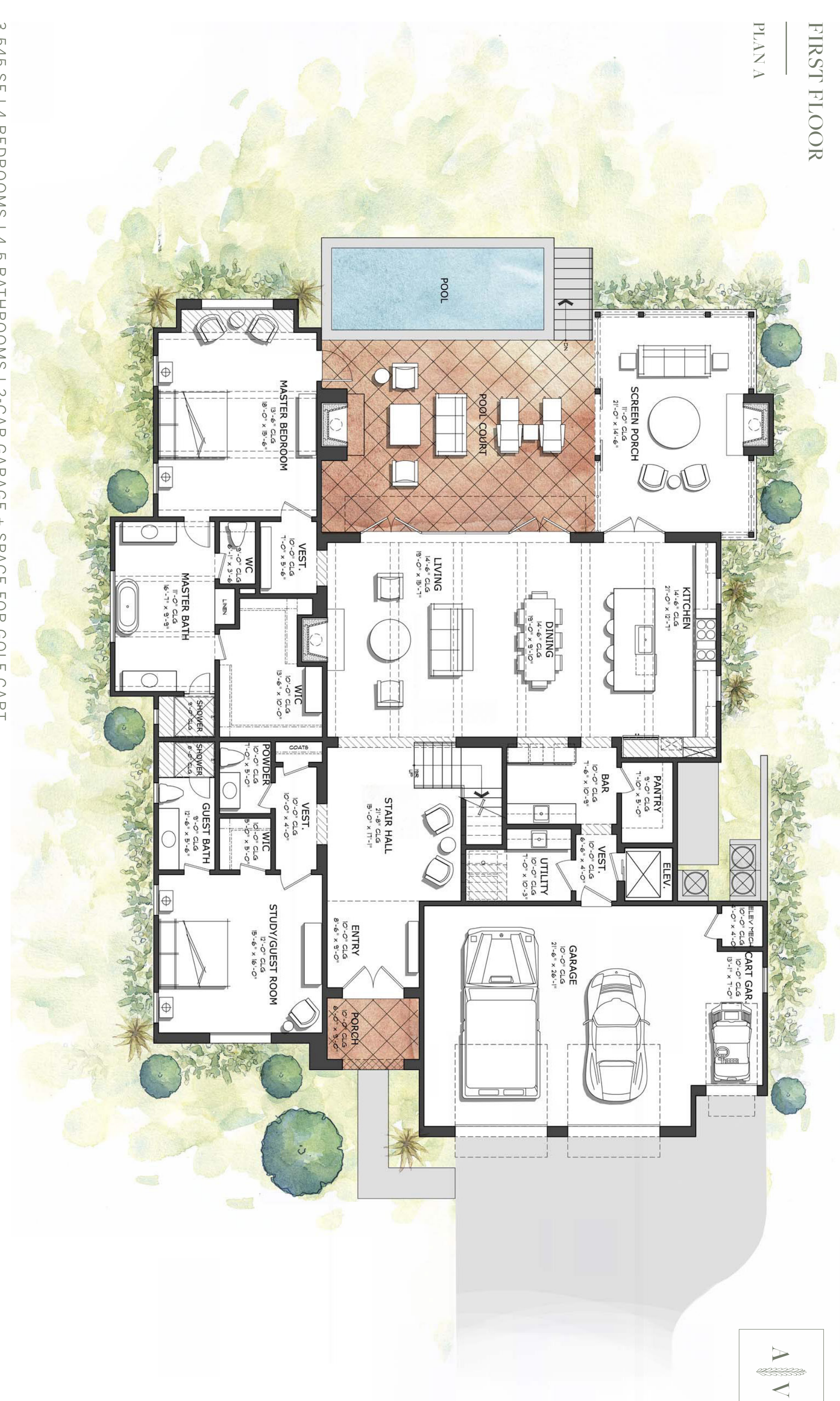
3,545 SF | 4 BEDROOMS | 4.5 BATHROOMS | 2-CAR GARAGE + SPACE FOR GOLF CART *VILLAS WITH THE DEN ALLOW FOR AN ADDITIONAL 350± SF OF CONDITIONED LIVING SPACE*